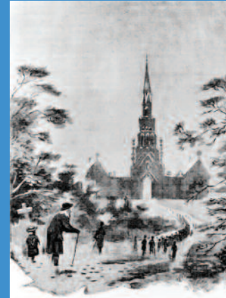
Image: st john's cemetery 1889

Pictured here in 1889, the cemetery was opened in 1857 to replace the graveyard of St John's Church in Grainger Street after a major cholera epidemic had led to the closure of all the graveyards in the town. Almost 105,000 people have been buried here since it opened.